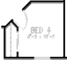
OPT BED 4