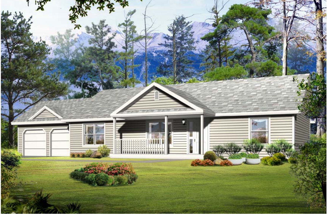
SHOWN WITH GARAGE, PORCH, & DECK BY OTHERS