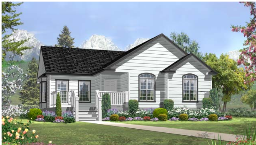
SHOWN WITH OPTIONAL ARCH TOP WINDOWS (DECK ADDITION & STAIRS BY OTHERS)