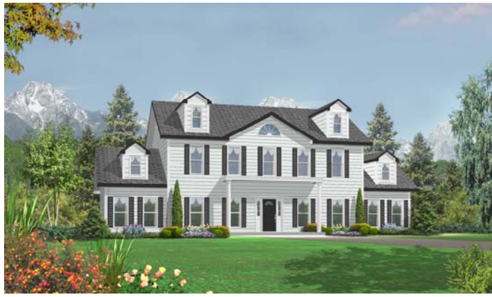
SHOWN WITH (4) OPTIONAL DOLL HOUSE DORMERS & OPTIONAL 1/2 ROUND WINDOW